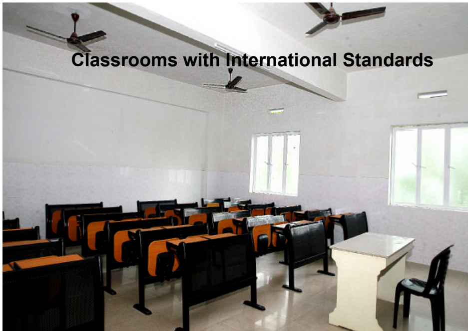
Classrooms with International Standards