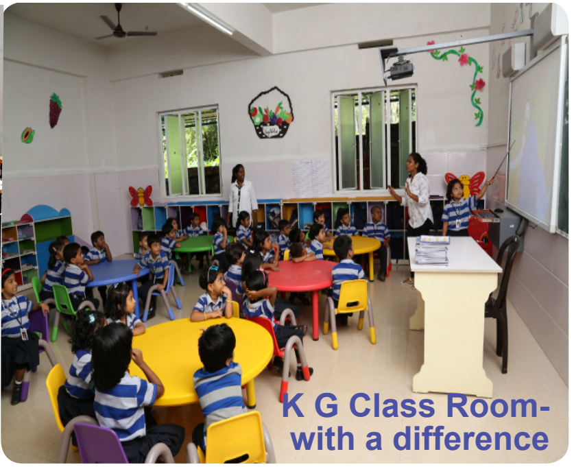
K G Class Room- with a difference